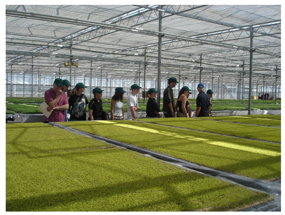
Figure 2: Visit to Madestein UK Ltd.